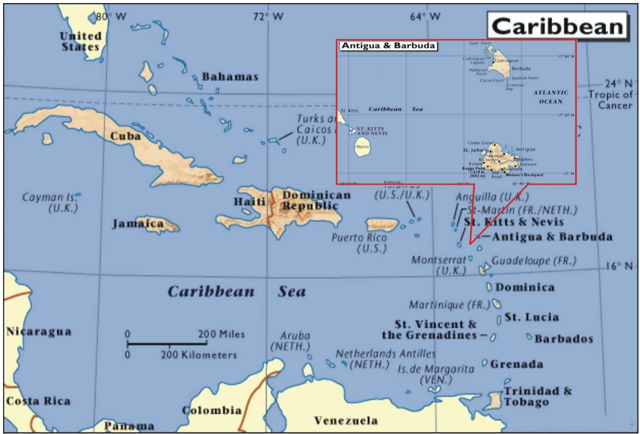
MAP 1: MAP SHOWING LOCATION OF ANTIGUA AND BARBUDA IN THE CARIBBEAN SEA