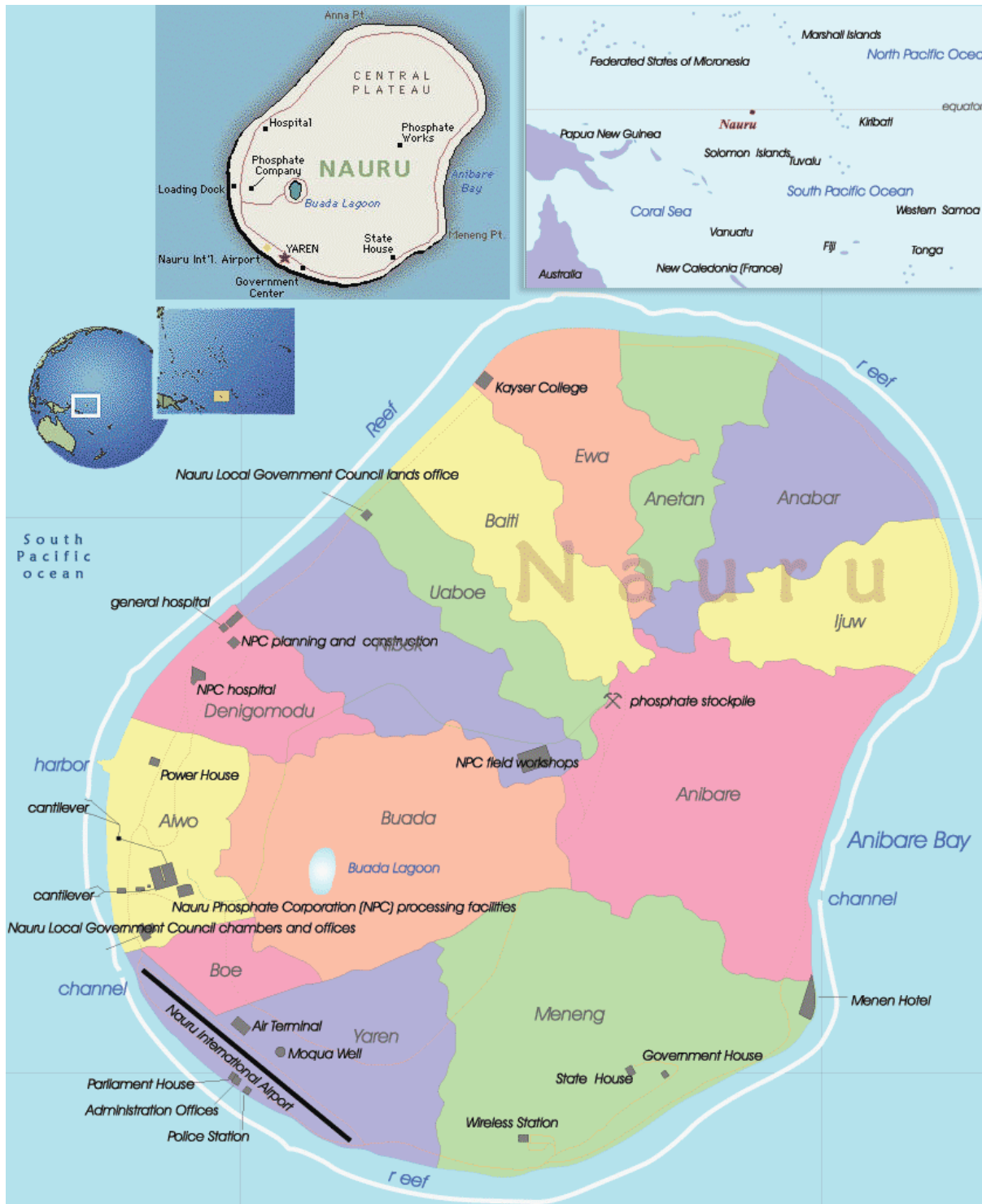
Figure 1. The location of Nauru and neighbours countries.

7. Nauru is surrounded by a fringing coral reef ranging from 120m to 300m wide, which drops away sharply on the seaward edge to a depth of approximately 4,000m. The coastal plain is a zone of sandy or rocky beach on the seaward edge, and a beach ridge or fore-dune, behind which is either relatively flat ground or, in some places, low-lying depressions or small lagoons filled by brackish water (e.g. Buada lagoon) where the surface level is below the water table (freshwater lens). The raised