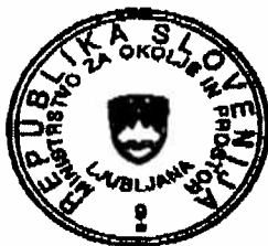
Emil Ferjančič GEF Focal Point for Slovenia