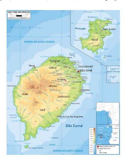
Figure 2. Map of São Tomé and Principe Islands showing the six target districts of Caué, Me-Zochi, Principe, Lemba, Cantagalo, and Lobata (CMPLCL) where the project will be implemented.

55. More than 60% of the population of São Tomé and Principe is concentrated in two of the seven administrative areas of the country, which account for 13.8% of the national territory. These are the districts of Me-Zochi and Água Grande, where the two largest cities (the city of São Tomé, which is the capital and the city of Trinidad) are located. By contrast, the district Caué, which accounts for 26.7% of the national area, only has 4.0% of the total population. Population density ranges from 3,145 inhabitants per km² in Água Grande to only 20.6 inhabitants per km² in Caué. Apart from the Água Grande District, which corresponds to the main town and surrounding São Tomé, the other districts also have a strong concentration of urban population in one single population center. The