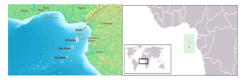
Figure 1. Map - Location of São Tomé and Príncipe