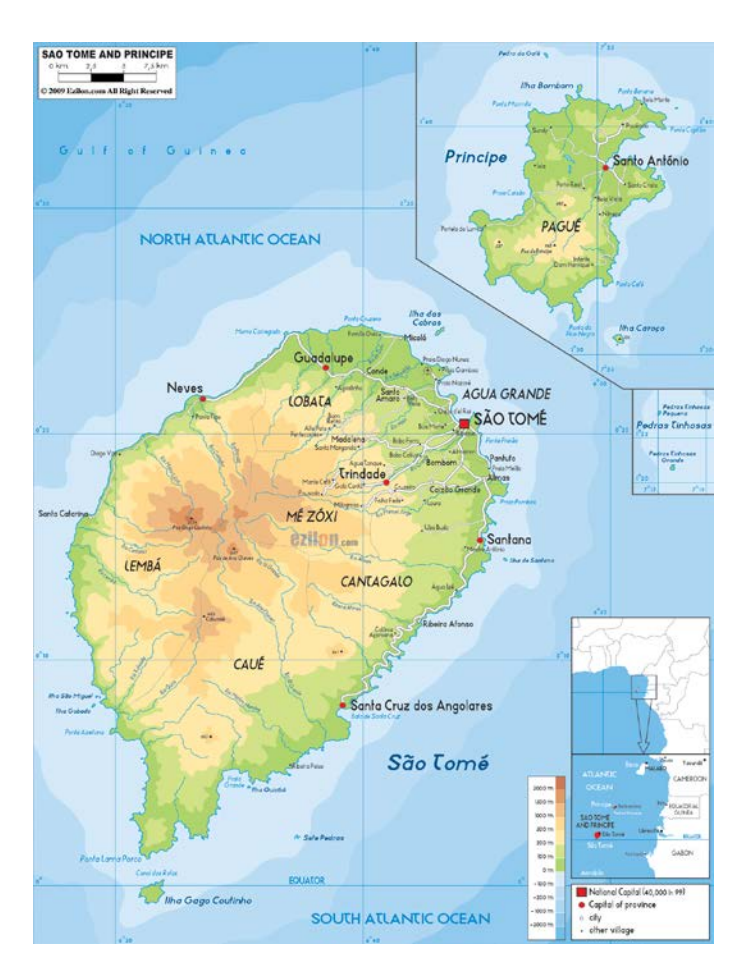
Figure 1. Map of São Tomé & Principe showing the main watershed network and the six intermediate watershed (Cantagalo, Caué, Lembá, Lobata, Água Grande, Mézóxi) flow ratessubdivisions.

The Hydrology Department had in 1960 a monitoring and collection network made up of 13 Manual Hydromet stations distributed over both Islands. However by 1970 the number of monitoring stations reduced to 5 Manual Hydromet Stations. With all the changes that took place during and post independency period the GoSTP decided in 1980 to renewed the entire HD network with 13 manual Hydromet station measuring water level, flow rates and meteorological data (Rainfall, Relative Humidity and Air temperature). Unfortunately between 1980 and 2011 the entire Hydromet network was vandalized due to common believe that Mercury in the thermometers was a precious metal with a high commercial value.