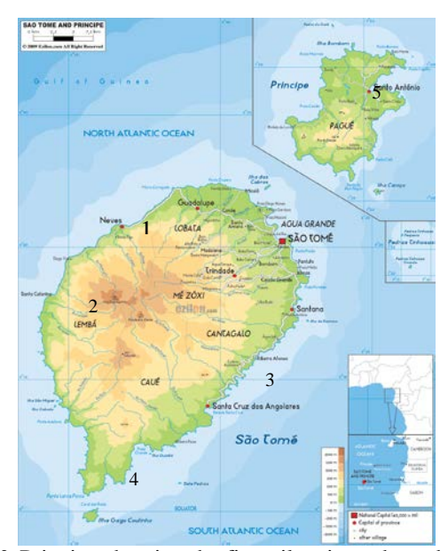
Figure 1. Map of São Tomé & Principe showing the five pilot sites where the ICB_EWS will be installed.