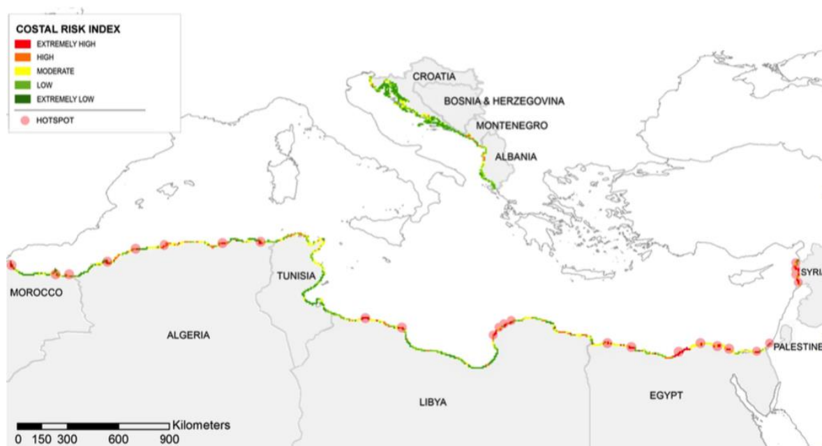
Risk Assessment Map to climate related hazards: erosion, floods, seawater intrusion (ClimVar Project, Plan Bleu 2015 based on coastal forcing, vulnerability and exposure)