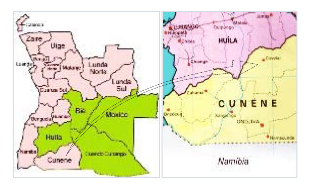
Figure 1. Map of location of Angola and the Province of Cunene where the Cuvelai River is located

1. Angola located in western southern Africa at 6-18° south of the Equator is one of the key water sources for central and southern Africa, with 47 main river basins draining its extensive, well-watered interior. Seven of its nine watersheds - including the Cunene (Figure 1), Cuando, Cubango, Zaire, and Zambezi -are shared by neighbouring countries. The country's densely populated 'central plateau', where the Cuanza, Cunene, and Okavango rivers originate, is perhaps the most important landform in southern Africa from a hydrological perspective. One of the important watersheds is that of Cunene River which gave its name to the province located south of the country and in the border with Namibia. The inhabitants of the Province which includes the municipalities and comunes of Cahama (municipality), Cuvelai (municipality and comune), Namakunde (municipality and comune), Kuroka (municipality), and Xangongo(comune) are overwhelmingly Ovambo pastoralists practicing for centuries the transhumance of their cattle. The greater part of the territory of the province is part of a great plain through which flows the river Cunene and Cuvelai with slight and gradual slope to the south and drains into the Etosha Delta in Namibia, directly or through a network of valleys and water lines usually dried (the omulolas), of which the most known is that of Mucope.