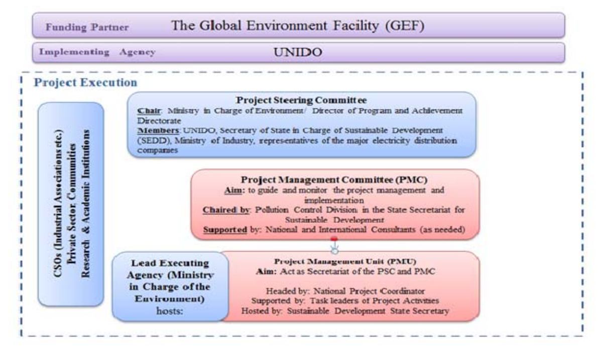
Graph 2: Project institutional arrangement

99. Graph 2 describes the institutional arrangement that was agreed with national counterparts for implementation of the project.