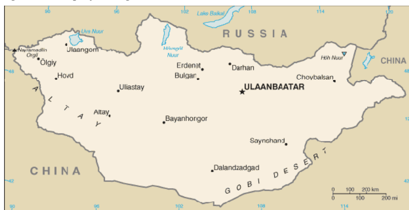
Figure 1: Map of Mongolia