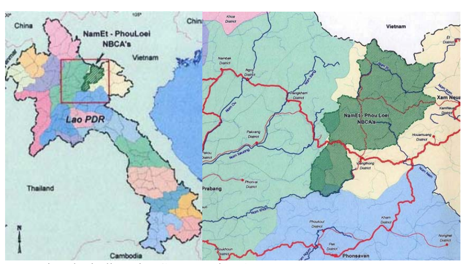
Map 2: NEPL National Biodiversity Conservation Areas