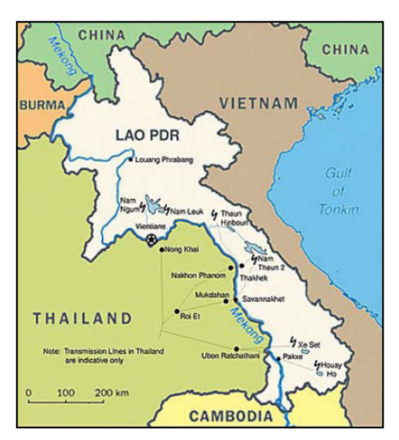
Map 1: Lao PDR

16. The agricultural zones of Lao PDR are divided into lowlands and uplands, where the lowlands have historically had the greatest agricultural activity and population. According to available statistics, "permanent" agriculture area covers about 5% of the country, of which about 4% is rice paddy land and 1% is agricultural plantations and other agricultural lands1. However, typically, rural communities use a wider area of "agro-ecosystem" encompassing "managed" or "semi managed" communal forests, grasslands and wetlands. The complex interweaving of culture and biodiversity both wild and selected through agricultural lifestyles forms part of the global significance of Laos' biodiversity. Rural people in Laos still rely substantially on plants, animals and fungi collected from the wild for everyday subsistence. Lao also has a rich cultural and ethnic diversity. In terms of biodiversity and specifically agro-biodiversity there is a wealth of Traditional Ecological Knowledge held by communities in Lao, especially those that are more remote and as such more reliant on natural biodiversity resources.