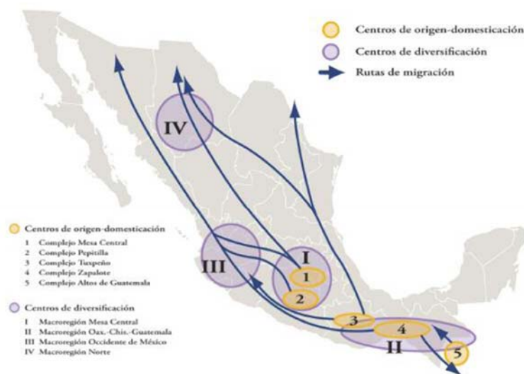
Figura 9. Mapa de México con las localizaciones de los centros de origen-domesticación y los centros de diversificación primaria del maíz.

Origin of maize in Mesoamerica. There are five centers of origin-domestication, four in Mexico and one in Guatemala. Kato, A.; Mapes, C.; Mera, L.M.; Serratos, J.A. y Bye, R. 2009. Origen y diversificación del maíz. Una revisión analítica. Universidad Nacional Autónoma de México. Comisión Nacional para el conocimiento y uso de la biodiversidad. 116 pp.