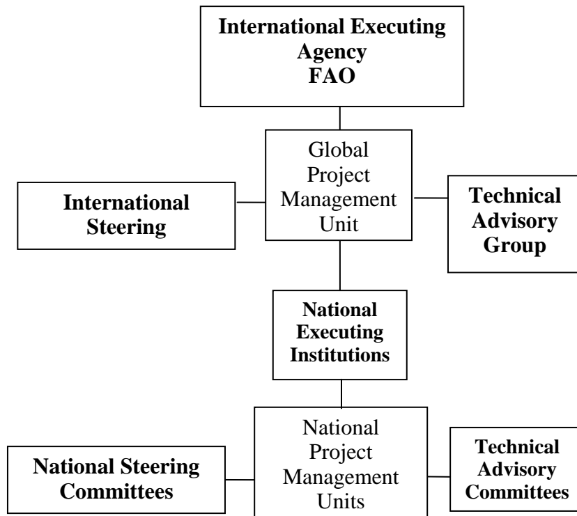
Figure 2. Project Management Structure, Global Level.