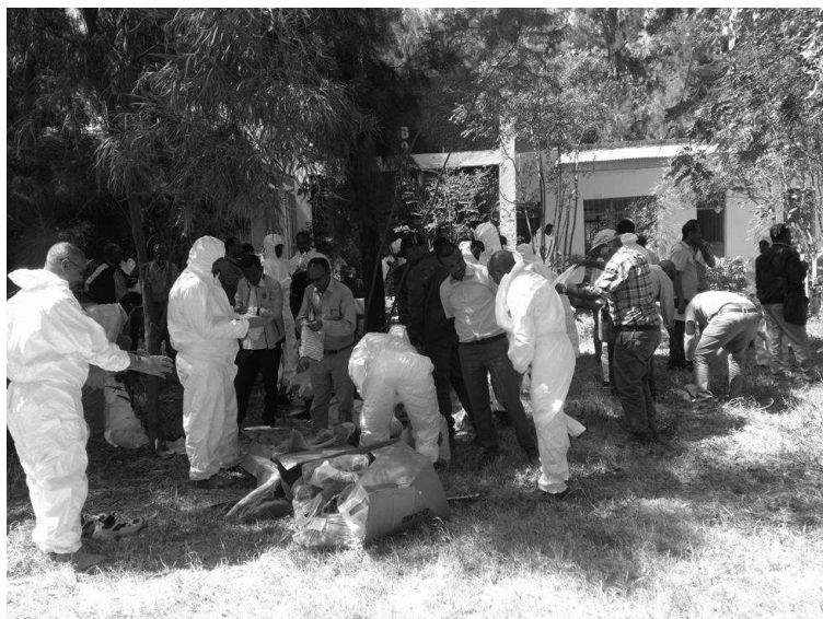
Photo 3. Trinees during practical exercise at Adami Tulu DDT store