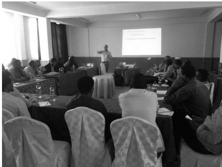
Photo 1. Trinees in the lecture room