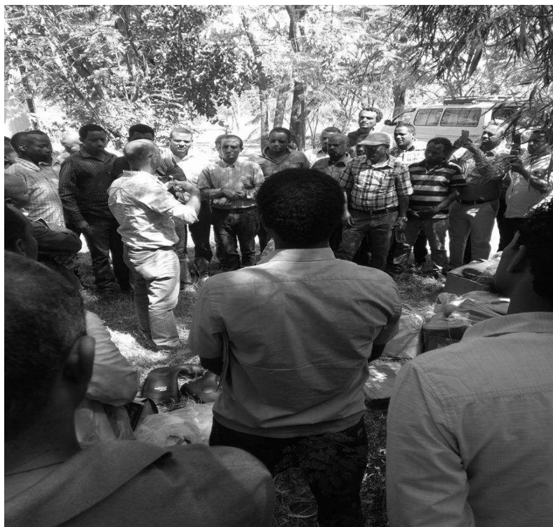
Photo 2. Trinees during practical exercise at Adami Tulu DDT store