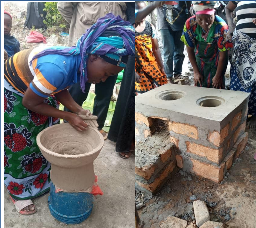
Training and fabrication of energy efficient cook stoves in Mvomero District