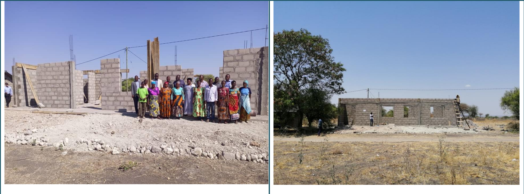
Construction of a Small Scale Leather Products manufacturing facility in Kishapu District.