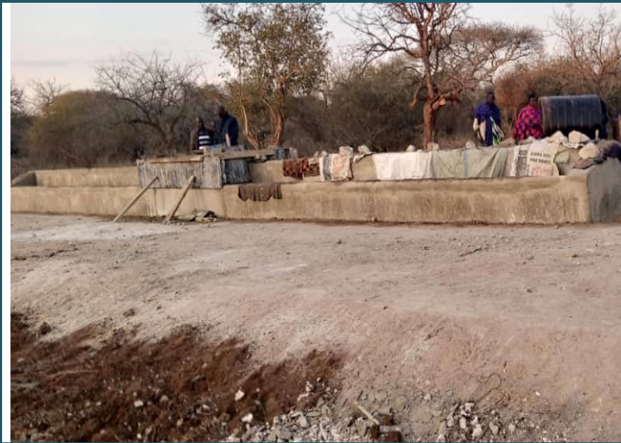
Construction of Cattle Water Trough in Simanjiro District. This is part of the Climate Smart Agriculture Activities.