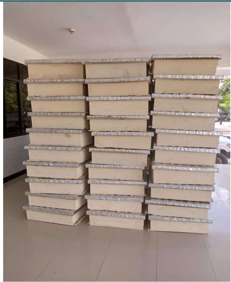
Training on beekeeping and provision of beehives to beekeeping groups in Kishapu District.