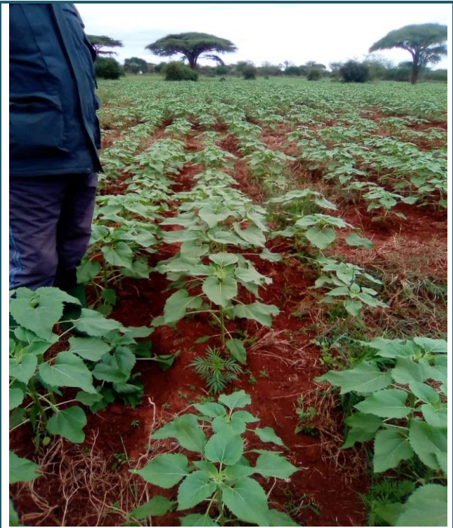
Farmer Field School for Sunflower production established in Simanjiro District.