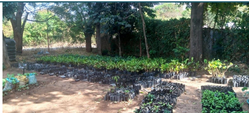
One of the nursery for cashew seedlings in Mpwapwa District