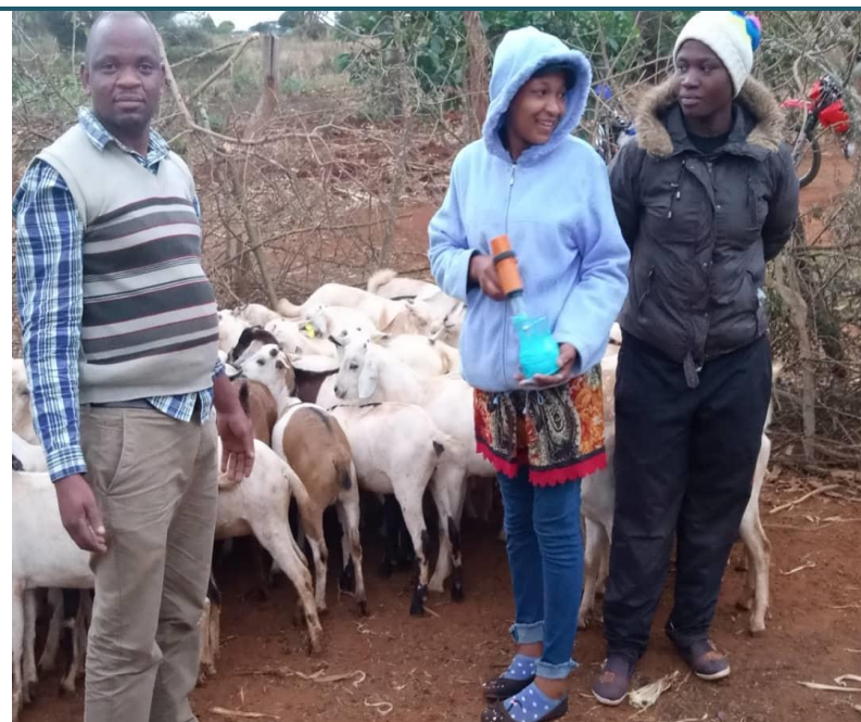
A total of 50 goats (Isiolo breed) to support the established goat keeping groups in Simanjiro District for purposes of improving local breeds.