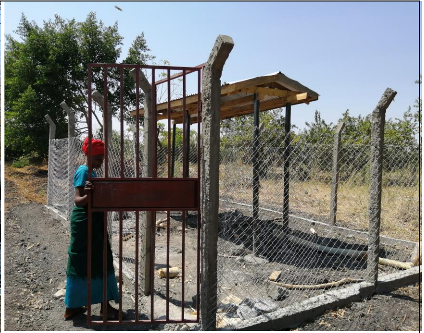
Bee Apiaries established in Kishapu District