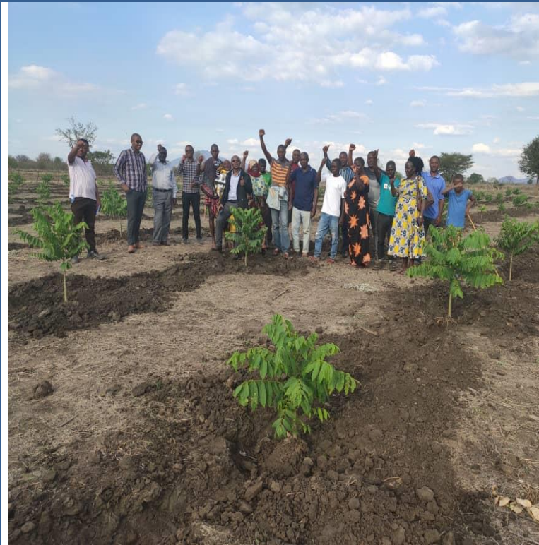
One of the beneficiary farmer plot planted with tree seedlings provided by EBARR project in Mvomero District.