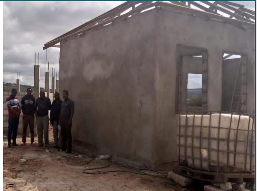
Construction of a Small Scale Leather Products Manufacturing Facility in Simanjiro District. This is part of the Alternative Income Generating Activities