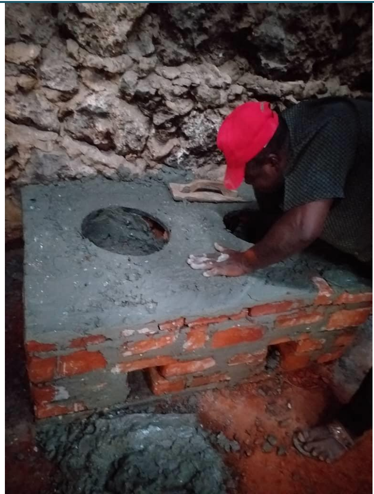
Training and Fabrication of Energy Efficient Cook Stoves in Kaskzaini A - Unguja, Zanzibar