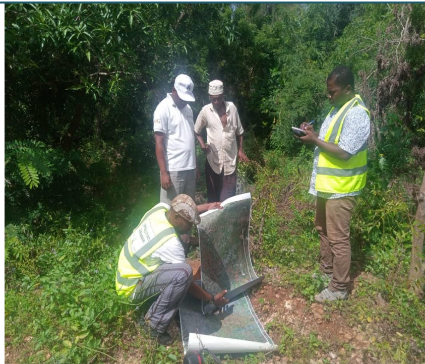
Participatory Land Use Planning in Kaskazini A - Unguja, Zanzibar