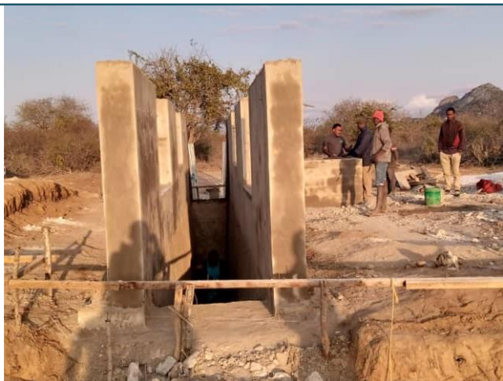
Construction of Cattle Dip in Simanjiro District