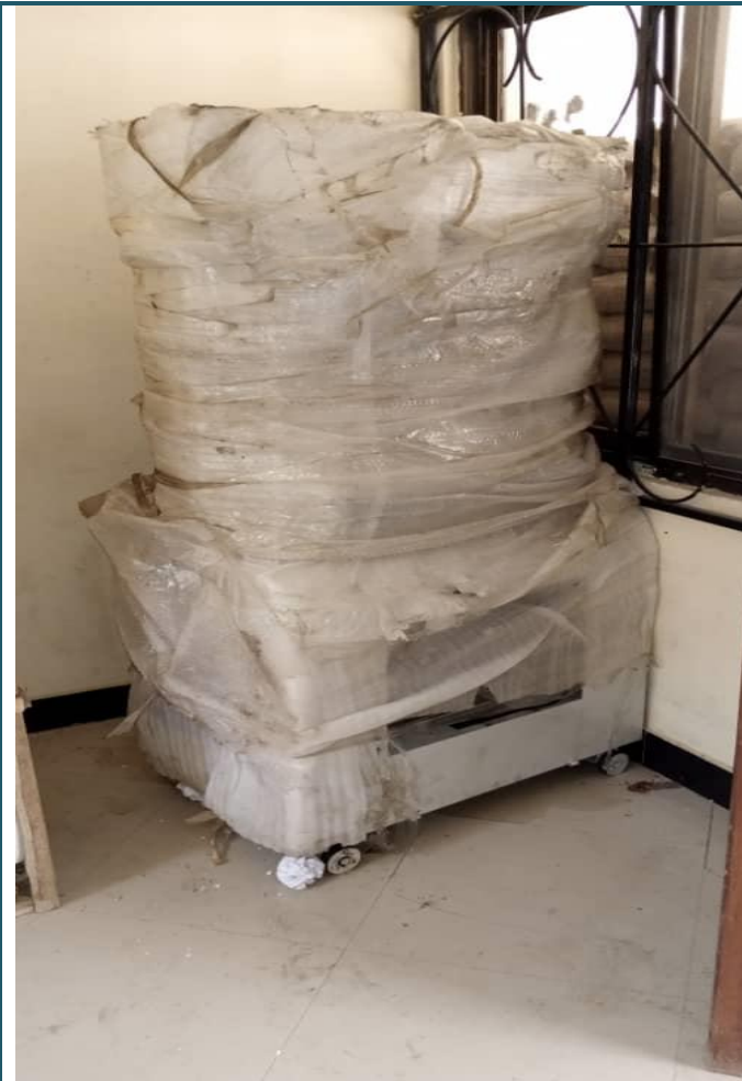
Some of the machines for installation in the Small Scale Leather products manufacturing facility in Kishapu