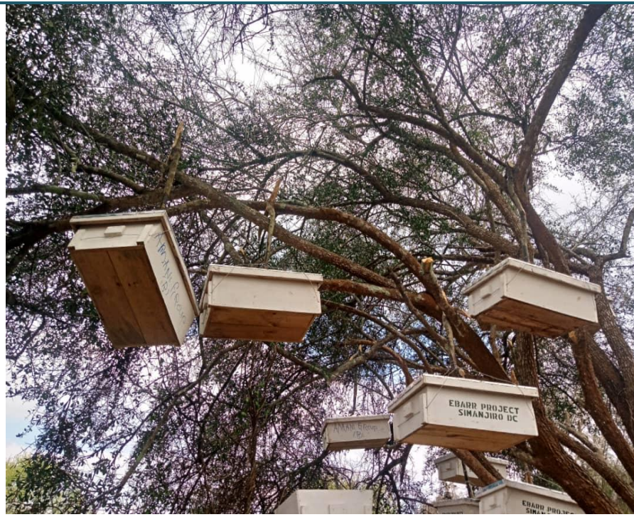
Beehives provided to beekeeping groups in Simanjiro District