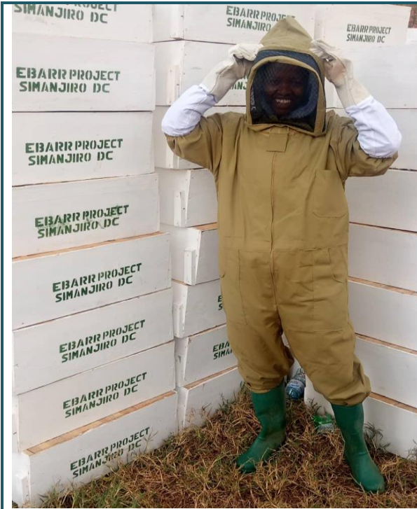
Training on beekeeping and beehives fabrication in Simanjiro District.