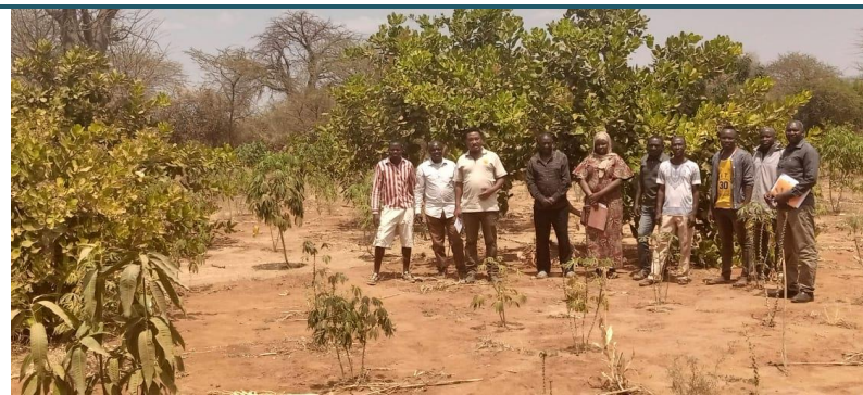
One of the cashew plot of a beneficiary farmer in Mpwapwa District