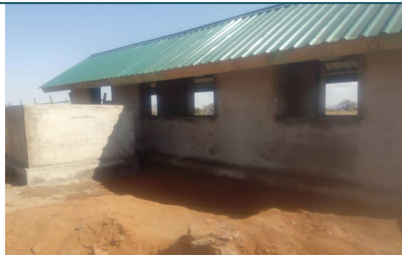
Construction of Cattle Dip for control of livestock vector borne diseases in Mpwapwa District.