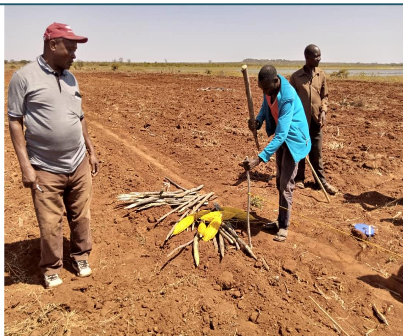
Preparation of Farmer Field School for Sisal production in Kishapu District.