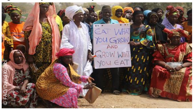
Figure 2. Project success story

Cheerful vegetable garden members advocate for food self-sufficiency in Kuwonku. The project-supported vegetable garden is an answered prayer for the community of Kuwonkuba