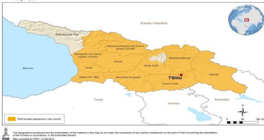
Figure 1 Map of project area

* For detailed geo-referenced maps with locations of interventions see Annex J