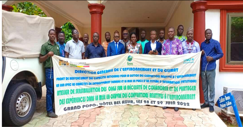
The Family photo of workshop for NGO actors.